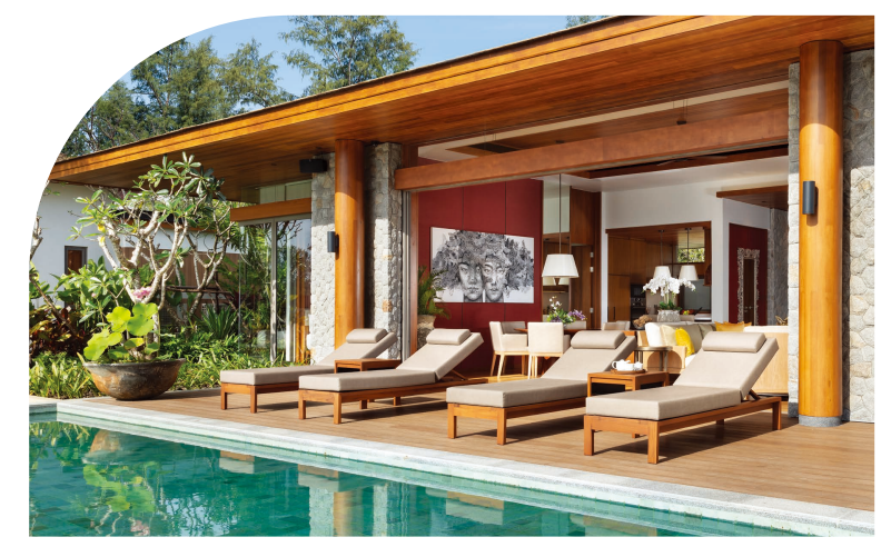
Property development in Hong Kong

Piling work for our property development project at 3–6 Glenealy, Central has been progressing well.